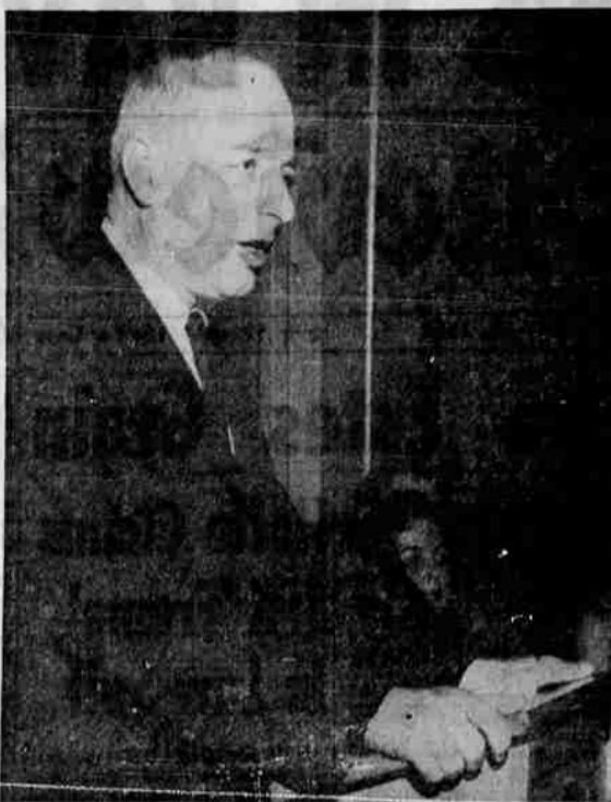
OREGON EDUCATOR Dr. Arthur S. Flemming tells Douglas County graduates it is up to them, as students in this generation, to insist upon a "pursuit of excellence" at the college education level. Flemming was speaker at a Roseburg Rotary Club banquet in the Umpqua Hotel honoring outstanding seniors of the county.

Participating families are asked to bring potluck and own table service.