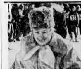
GOOD TURN — Charlotte Whitten takes a turn around a snowshoe racing course. This would be noteworthy save for the fact that she is the Mayor of Ottawa opening that Canadian capital's noted Winter Carnival.