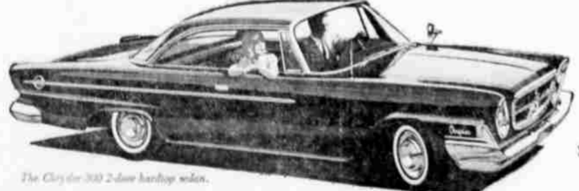
The Chrysler 300 2-door hardtop sedan.

smoother, long-wheelbase ride... battery-saving alternator... (And so the list rolls on... and on... and on... like the Newport that was a class-winner in last year's Mobilgas Economy Run.) Still skeptical? Fine! Your dealer will be expecting you. *Manufacturer's suggested retail price, exclusive of destination charges. White walls extra.