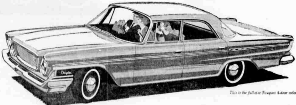
This is the full-size Newport 4-door sedan.