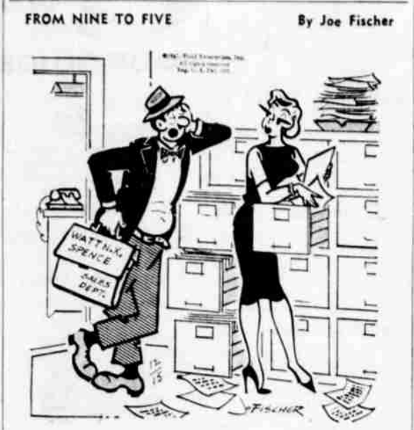
"I'm sure a go-getter. They had to put on extra help to take care of my orders in the cancellation de-