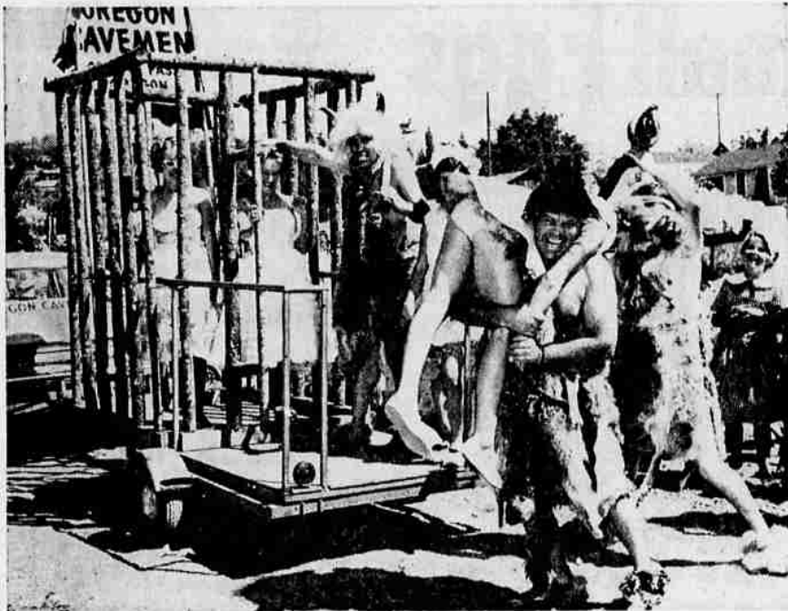
SPECTATORS at the Myrtle Creek Fall Festival parade Saturday, especially the women, were shrieking, screaming and running as the Oregon Cavemen from Grants Pass came down the route wailing clubs and scoring people half to death. The Cavemen were awarded a special blue ribbon for their antics in the parade judging. This is the second time they have appeared in a Douglas County festival. They were at the Reedsport Fleet Days July 15 and 16.