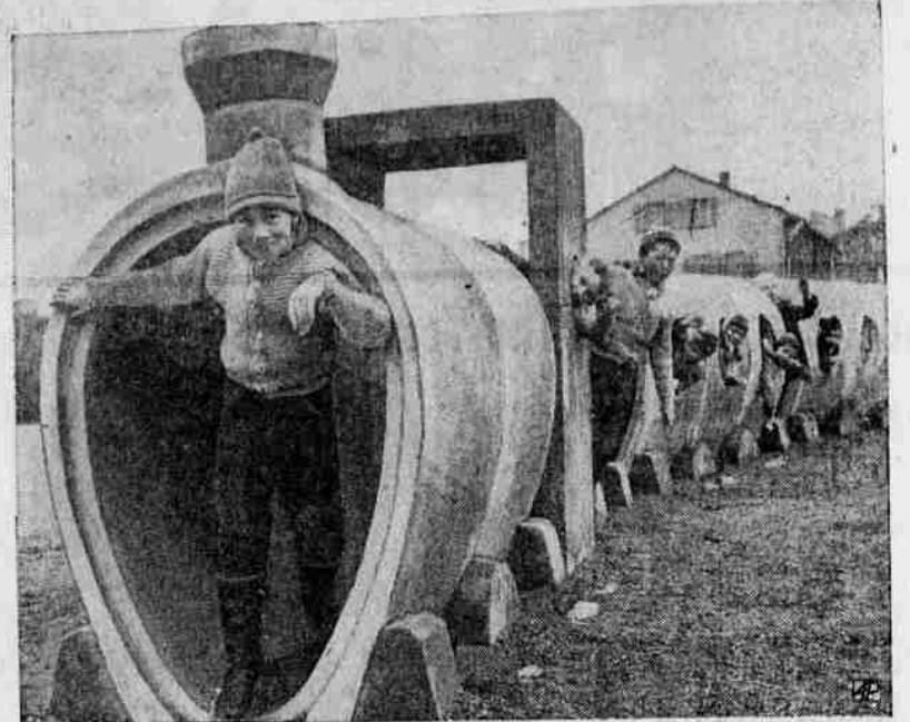
DOESN'T CHUG CHUG —These youngsters have to imagine the chug-chug and choo-choo when they play on this concrete model railroad train in a playground in Offenbach, Germany. In turn the passengers become engineer or fireman on the play train.