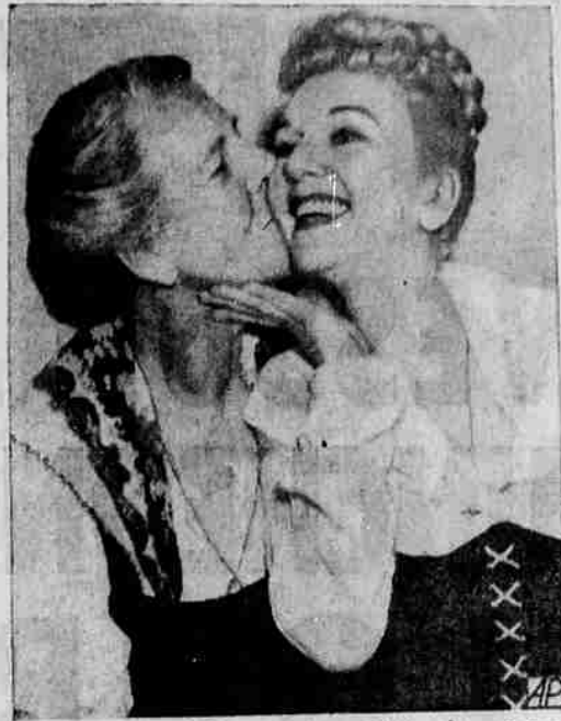
BACKSTAGE —Maria Trapp, left, backstage visitor at "The Sound of Music" on Broadway, gets a warm greeting by Mary Martin who portrays Mrs. Trapp in show.