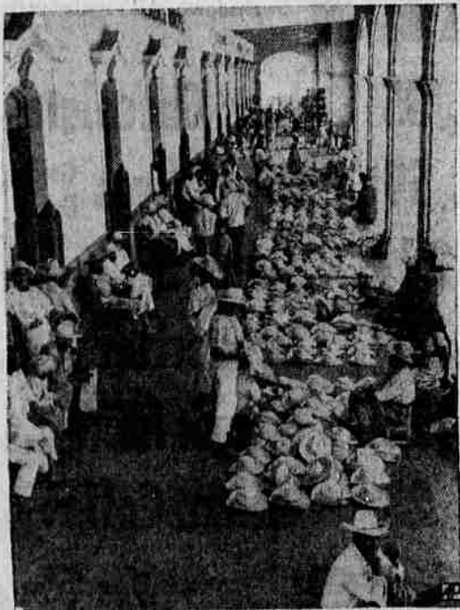
SHADY SALE —Sombreros, "musts" for Mexican farmers, are sold by hundreds in this corridor of the Ocotlan market in south Mexico. Prices range from $3.50 to $25.00.