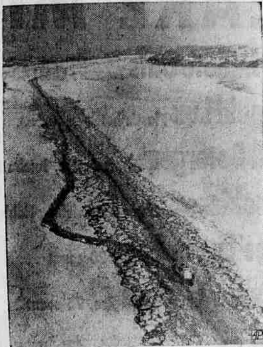
ICE IN DRINK —A Coast Guard cutter makes wobbly post-New Year path through ice in Hudson River near Glasco, N. Y., about 110 miles north of New York City.