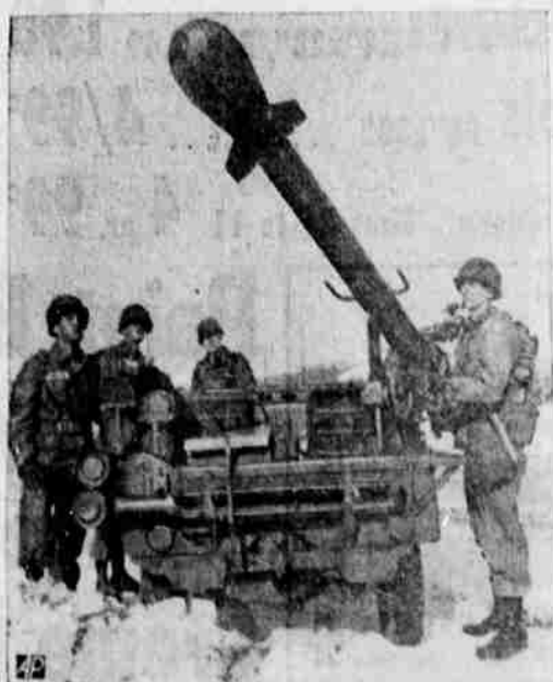
MIGHTY MITE —Bulhaus atomic warhead of Davy Crockett weapon, shown on jeep launcher, is said to give small Army units the fire power of massed artillery.