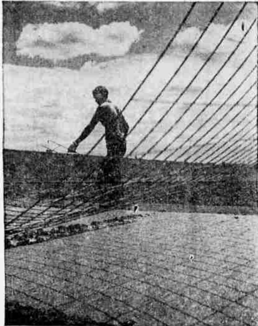
GEOMETRIC PATTERN is formed by shadows on freshly-laid concrete as steel reinforcing mesh is put into position. Mesh is vibrated into the fresh concrete, provides added durability. Modern concrete highways, such as this project near Eugene, being constructed in Oregon are of eight-inch reinforced concrete and designed to provide useful service life of 50 years and longer, say spokesmen for the Cement Industry of Oregon.