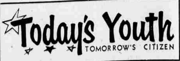
8 The News-Review, Roseburg, Ore. — Mon. April 13, 1959

The three Roseburg hot rod clubs have begun to lay the groundwork for a Central Oregon Timing Assn.