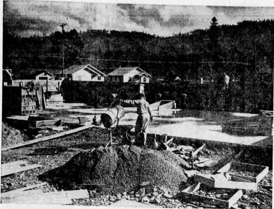
WALLS GOING UP — Concrete block walls are going up in Winston for a new building to house Howard's Hardware. The business is owned by Ken Day and Lyndon and Warren Lengele. It is located just south of Model Market. The structure is 40 by 84 feet, plus a 20 by 85 warehouse to the rear for building supplies. (Paul Jenkins)