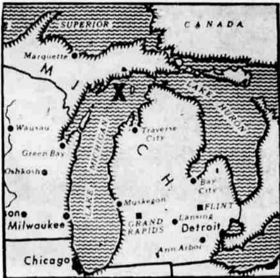
WHERE BOAT WENT DOWN —"X" marks the spot on Lake Michigan where the 600-foot cargo steamer Carl D. Bradley broke in two and sank with its crew of 35 men, during a violent storm. Two members of the crew have been saved, but there is little hope for the other 33. Several bodies have been found.