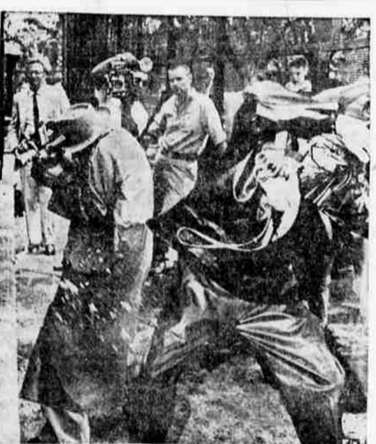
CAMERAMEN GET BAMBOO'S CAKE — Cameramen, who came prepared with old clothes and slickers, duck as vegetables and fruit from Philadelphia Zoo's Bamboo, huge gorilla, is fired through bars of his cage. Bamboo celebrated his 31st anniversary at the zoo Tuesday Aug. 5 and went through his routine of throwing the birthday gifts at cameramen.