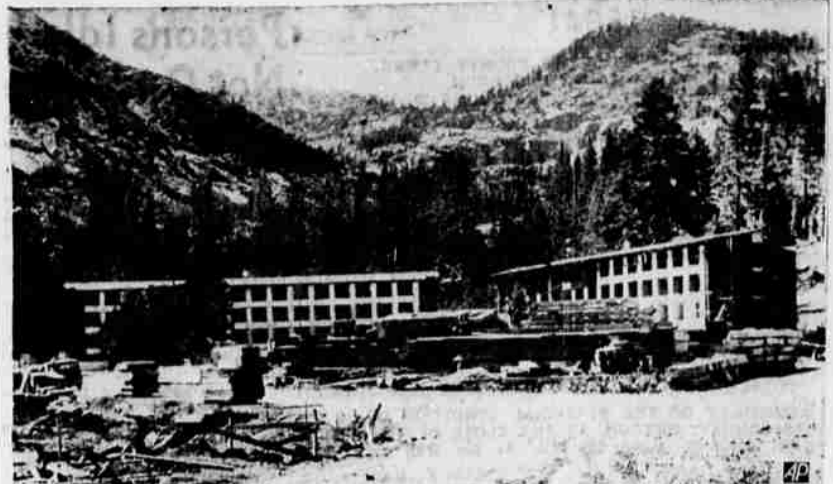
WINTER HOUSING —Two nearly completed dormitories for 1960 Olympic Winter Games athletes are nestled in a secluded and scenic corner of Squaw Valley, Calif., as preparations for the international games go forward. Other facilities are being brought to rapid completion, including two additional dormitories.

SOUTHERN ASSOCIATION Mobile 2, Birmingham 1 Chattanooga 7, Little Rock 0 Atlanta 6, New Orleans 5 Nashville 7, Memphis 3