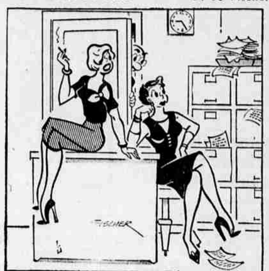
"How does he expect us to feel . . . having to start every day by getting up in the morning?"