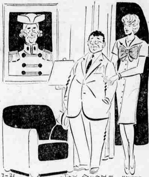
"Gee, Uncle Wobbly, I can hardly wait until you're one of my ancestors!"

Trademark Registered U. S. Patent Office