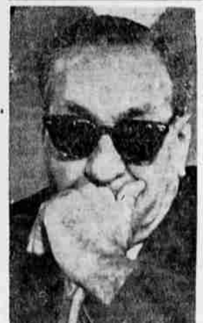
WEARING CHEATERS — Tony Accardo, reputed leader of the Chicago crime syndicate, invoked the Fifth Amendment to avoid answering questions of the Senate labor rackets committee in Washington, and made an unsuccessful protest against being televised.