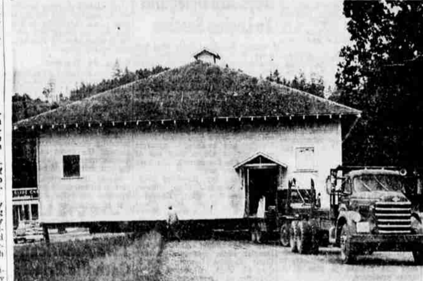
MOVING DAY — A 110 by 92-foot Glide School gymnasium was moved Friday from school property to a lot leased by the Glide Community Club on the North Umpqua Highway. The school district donated the building. While the structure was being moved the highway was closed to traffic and vehicles were routed over the old highway. Ahre and Richmond, a Eugene firm, had the moving contract. About 3 p.m. Friday dollies under the front of the gymnasium mired in mud at the new location and the movers were trying to raise the building today.