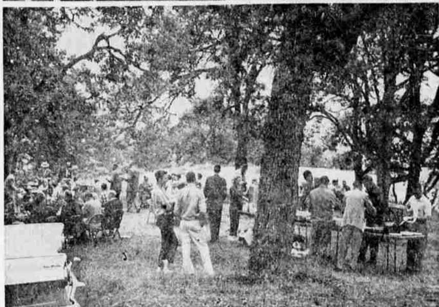
INSIDE VIEW of the quarter-million-dollar microwave repeater station is seen at top during the inspection tour Thursday conducted for members of Roseburg Rotary Club. Operation of the unit designed to relay and boost signals for three television networks, American Broadcasting Co., Columbia Broadcasting Co. and National Broadcasting Co., to stations in the Northwest. At bottom, members are shown having a mountaintop luncheon in a cleared area near the repeater station.