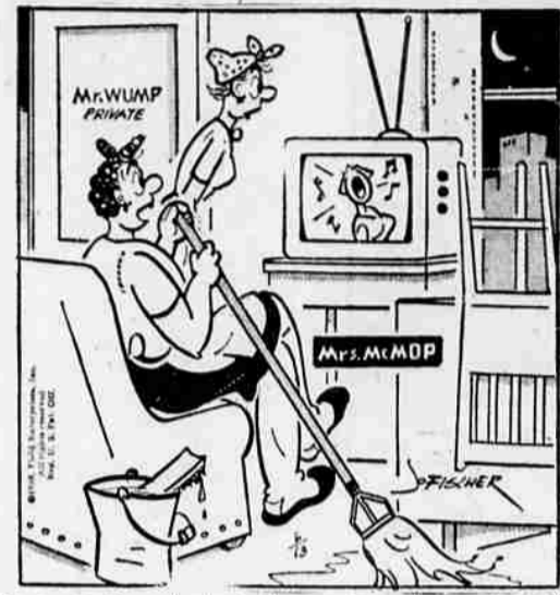
"If you can't understand the words and its no good for dancing, then its opera."