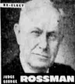
JUDGE GEORGE ROSSMAN Judge of the SUPREME COURT position number 7

The boys' mother died of a brain hemorrhage two years ago.