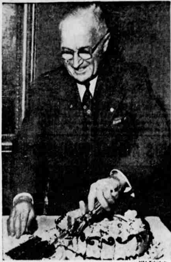
HAPPY BIRTHDAY HARRY —Former President Harry S. Truman cuts birthday cake during surprise party celebrating his 74th birthday at the Truman Library in Independence, Mo. The former chief executive was greeted by a chorus of "Happy Birthday" as he walked in the door of the library.