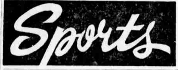
The News-Review, Roseburg, Ore.—Fri. Mar. 21, 1958