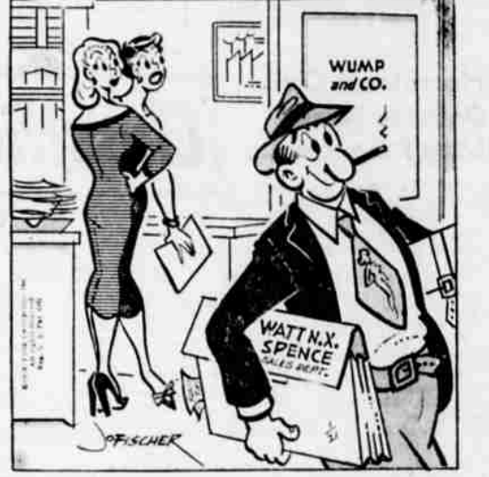
"He never brings in any orders but all his customers say he tells the best stories."