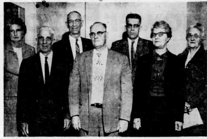
COUNTY CLERKS from counties in the Fourth Congressional District met in the Douglas Courthouse in Roseburg Tuesday to discuss new state election laws.

Low temperatures in western Oregon Wednesday ranged in the 40s and 50s. Pendleton in Eastern Oregon had a low of only 43. Baker had the state's low at 28.