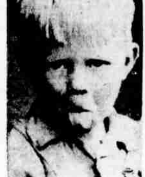
TONGUE-TYPED —Blond, but not fair-haired as far as the photographer is concerned, is this lad in Melbourne, Australia. The barefaced boy with cheek apparently refused to say a word for this picture.

Some Congress members already are contending that such projects add more than their cost to the nation's wealth, and must not be neglected.