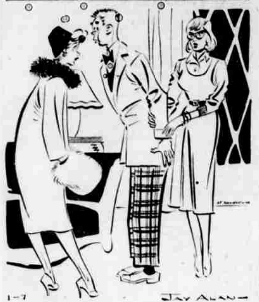
"It was love at first sight — but I didn't have my glasses on!"