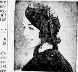
"Scotch warmer" — A particularly wonderful gift for the younger set is this cozy muffler with matching beret in authentic Tartan plaid design.

Too often a Christmas party is fun for everybody except the hostess. With a freezer, however, the hostess can have more fun than anybody. Because, in addition to enjoying the party, she has the knowledge that she's achieved a social success with a minimum of effort. To eliminate most of the fuss involved in getting ready for the affair, plan the party menu, prepare the delicacies in advance and freeze them. On the day of the big event all that's needed is to remove the party food from the freezer, ready for serving. All kinds of foods can be frozen — cakes, nut breads, fruits, sandwich spreads, canapes and pies, or even a steak or Cornish game hen. Many kinds of containers, packages and wrapping materials have appeared on the market to keep party delicacies fresh and good tasting. A container that's moisture and vapor proof is a must.