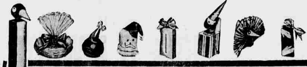
Miniature Laundry Basket and note says "Freeze it gift for Christmas." Small skillet wrapped like a gift with note telling about gift or new range. Toy refrigerator-bank available in toy department tells its own story. Glamour box of gaily wrapped bath salts announces gift of hot water heater. Toy washing machine can be disguised as a lack in the box to symbolize gift. Travel iron dressed like a bird announces gift of new automatic ironer. Hand lotion signifies that a dishwasher will give you all the heavy work.

to your gift giving this Christmas that will be a lot of fun for the whole family. Everyone can get together about a week before Christmas and "cook up" a few gifts. This is meant literally, because your range and freezer can be used to help prepare a few extra gifts for some friends who may drop in unannounced. No pushing through large department store crowds for these gifts, either. The only crowded place will be the oven and the top of your range as you bake delicious pies, cakes, candies, and other delicacies. You will have a lot of fun just deciding what flavor pie to bake in case Aunt Minnie drops in for a Yule visit; or whether to put a peach or pineapple filling in the cake. Of course, the whole family can work together at helping Mom prepare these practical gifts. Then there's no better place to hide your gifts than the freezer—and not because there's no room left in the closets, but because the freezer will keep your gift food items as fresh as the day you baked them.