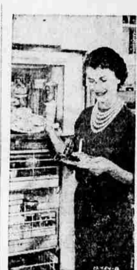
Freezer party — The hostess can have as much fun as anyone at her Christmas party if she plans her menu ahead, does her preparing in advance, and stores her food in her freezer. The freezer will take good care of her food and have it ready and delicious at party-time without fuss.

You can gift-wrap each item separately, using a wide variety of freezer papers and containers, and attractive cellophane, foil and plastic. This sure makes for easy and quick gift giving. If you devote one section of your freezer for these gifts, you can save the wrapping until you're ready to give it away. But if you spread the packages throughout the general food area of your freezer, it's best to wrap the packages first so they can be easily identified. The variety of gifts that you