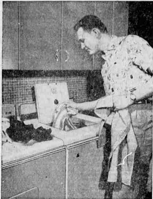
Man around the house: Even for a man, housework isn't drudgery when there are modern appliances to do the work for him. A pair of laundry servants, like this new washer and drier, make the job of doing the family wash as easy as pie—for man or woman. Keystone of the dream kitchen is the modern cabinet sink. Replace your old sink with a new cabinet model to put increased efficiency into your existing kitchen and make the room so much more pleasant to work in.