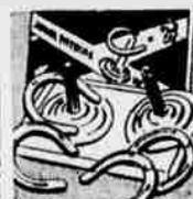
Here's the pitch. 4 rubber horseshoes, 2 wooden pegs. 66c