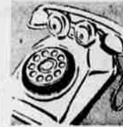
Number pulses. Steel dial phones. Bell ring. 66c