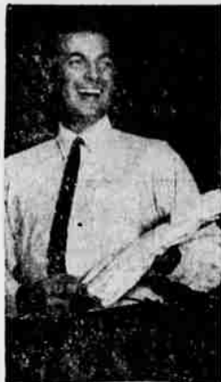
Wash and wear — A white business shirt is a welcomed gift. And, it's a practical one, too, when it's in 55 per cent "Dacron" fiber blended with cotton because it requires little or no ironing.

There is a wide variety in both items and price range for the auto. Give the car owner on your Christmas list an accessory for a marvelously novel gift.