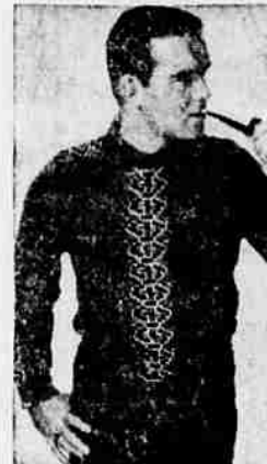
Convertible-collared casual — will be warmly received by your favorite male. The collar of this 100 per cent wool Scandinavian ski sweater can be worn as seen or tucked in as a crew neck.