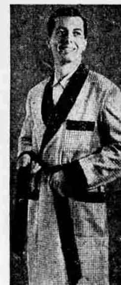
Checking in for a man's Christmas is this handsome robe with contrast trim.