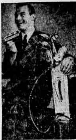
Can't beat it — golf gifts for the man who does! A good gift is balls since no one ever has enough. A new bag would please him plenty. Or how about clever golf head covers!

Choose with thoughtfulness and your gift to the collector will be most appreciated.