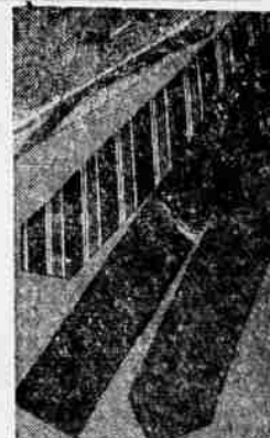
It's a tie—for first place among popular gifts for the man on your list. These spots and crease-resistant ties are available in stripes and subtle woven prints. Narrow widths.