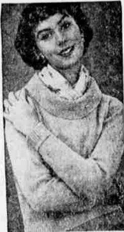
Love match — low, cuffed necklines on new bulky sweaters "love" colorful, soft silk-crepe squares... an exciting duo for gifts!

Fur is always a fabulous gift — one she'll love you for giving.