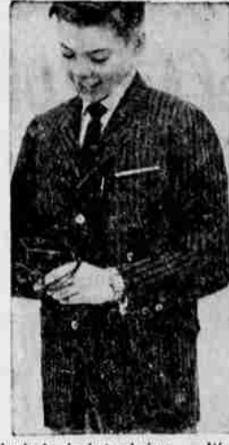
Junior's jacket choice — It's a shirting weight jacket of an imported cotton, Swiss GoTahna, with the look and feel of silk. Authentic Ivy Styling and striped pattern. Washable.

One of the earliest public printings was "Silent Night," appearing