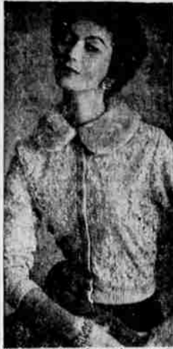
Deliciously lace-trimmed — topped with Borgana collar that makes this sweater perfect for dressy evening affairs. It's completely tubbable. What a delightful Christmas gift!