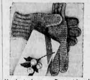
Handy to have — Practical, warm, wool knit gloves are perfect gifts. Shown — wool knit style, with leather palms — wonderful coordinates to wear with tailored heavy outerwear.

ing in 1840. Some authorities believe it was a folk song. Others say it was written by a parish priest in Salzburg, Austria. Yet others say it was first called "Der Christnacht" and composed in 1818 by Frantz Xavier Gruber to words of Joseph Mohr. The latter was the pastor of a Lutheran Church in Austria. Gruber was the church organist.