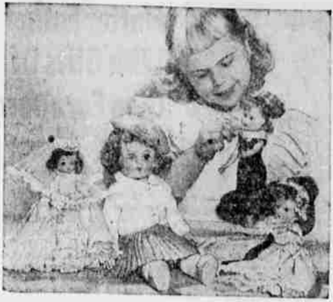
Dapper dolls — for little mothers! Each doll wears high fashion clothes from head to toe with perfectly matched accessories. Even their under-clothes are ever-so elegant.