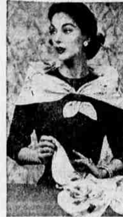
Soft silk scarf — makes a lovely Christmas gift. Field flowers in flung all over pastel grounds in this 36 inch square. It's hand-rolled and edged with a contrasting hue.