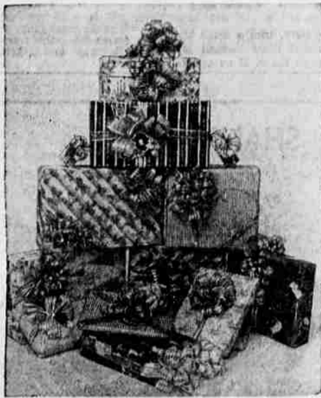
Suffer "wrap-it-itus" woes? — Start with beautiful paper and just add a bow. This year you don't even have to make a bow. There is a big selection of lovely, fluffy, ready-made ones.