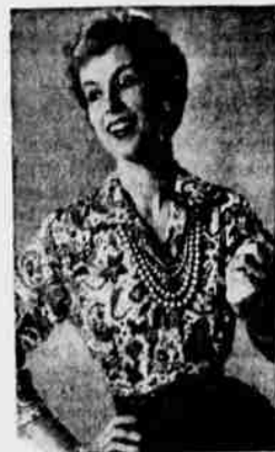
Flowers 'grow' on you — in this delightful, delicately tailored blouse. The soft wing collar is completely reversible. Choose from either the three-quarter (shown) or long sleeve.

A gift of toiletries is always suitable — for every age — in any price. There are many wonderful, special-for-Christmas items, too.