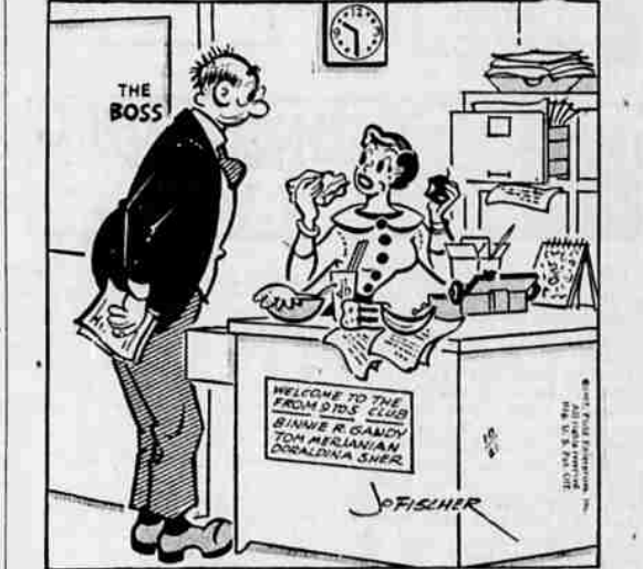
It's just a little something between the breakfast I didn't eat and lunch I won't have time to...