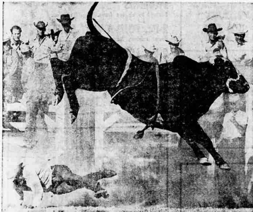
HITTING THE HARD, HARD GROUND , a bull rider gets dusted by a high-kicking brahma. The rider must hang on for eight seconds, has only a loose rope without knots or hitches to help him keep his precarious seat. To make the mean tempered bull even madder, the bull rope has a bell underneath the animal's belly and a flank strap that is pulled up tight as the bull leaves the chute.