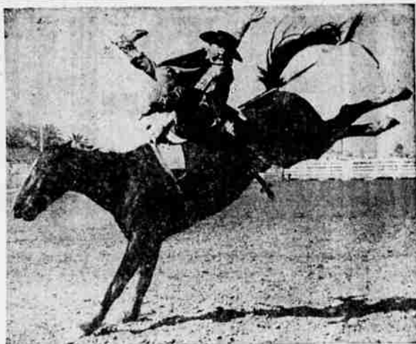
A FIRM GRIP ON A HURRICANE is maintained by this bareback rider who clings tenaciously to the simple leather handhold on the rigging for a violent eight second ride. He must spur the unbridled horse over the point of the shoulders on the first jump out of the chute to qualify and lick him well during the ride to score high. He can't touch any part of the horse with his free hand, but there are no rules restricting what the bronc can do to dump him.