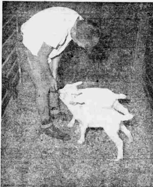
ANGORA KIDS come to dinner at the fair last year. Besides competition among animals, 4-H entrants will compete in showmanship in most classes. (Photo Lab)