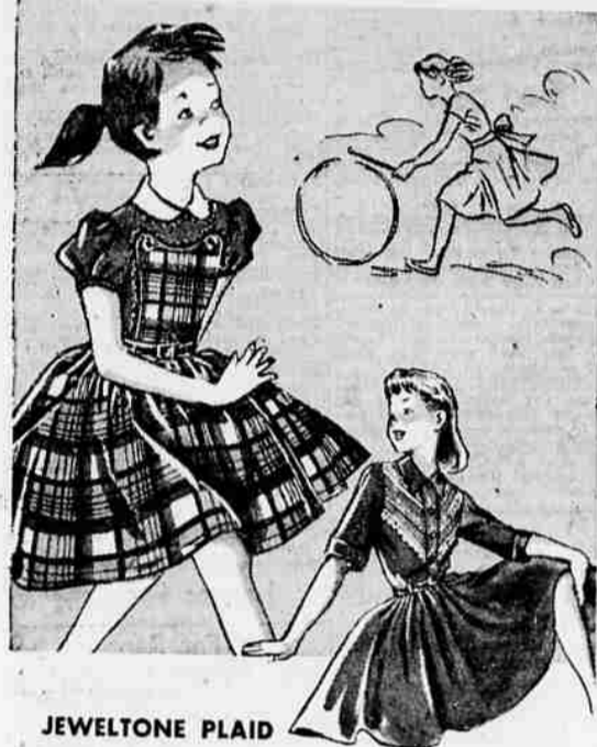
JEWELTONE PLAID AND SOLID