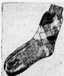
combed cotton Men's Argyles

36" Famous First Quality Percale, Broadcloth NEW FALL PRINTS Lengths to 10 yds. Newberry's Low Price 37c If full bolts would be 69c yd.