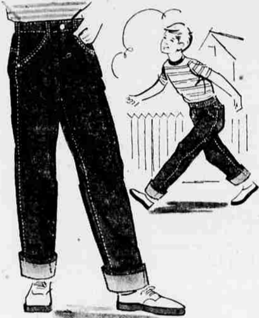
BOYS' SANFORIZED*, VAT-DYED BLUE DENIM

Blouse-effect and trim shirt-front styles. With a variety of trims: jewelled buttons, ric-rac, lace and more! Many colors to choose from. All washable. Sizes 7 to 14.