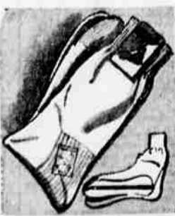
reg. 3 prs. $1.15 men's Cushion Socks

Really rich selection of fancy patterns and colors sure to please the fussiest guy! Of quality yarns. Washable. Buy now! 57c pr.