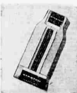
1 size fits 10-13 Men's Stretch Sox

Big assortment of fancy patterns in washfast colors. Nylon reinforced at heel and toe. Sizes 7 to 10 1/2. An excellent value! 39c pr.