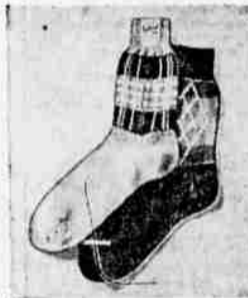
mercerized cotton Boys' Slack Hose

Favorite overplaid and classic patterns in this group. All in vat-dyed colors. Sizes 10 to 13. A fine 2/100 value.