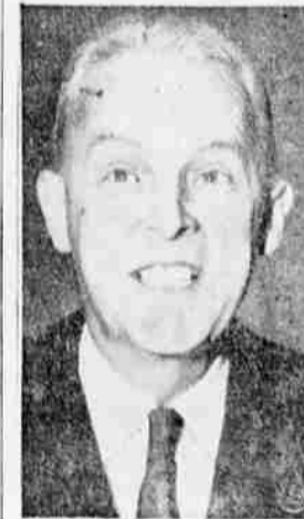
STICKING —Although there are some powerful Democratic leaders who would like to ease him out, Paul Butler, chairman of the Democratic National Committee, is expected to hold his job through the 1958 elections. Then—he expects—he could retire a winner.

Uniqua Valley HARDWARE Corner of Oak and Jackson ORchard 3-6628