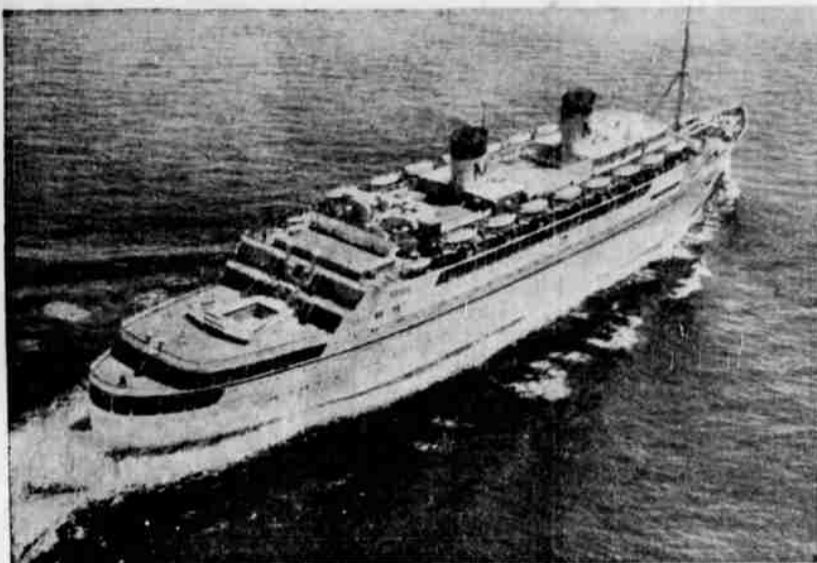
HEADING OUR WAY—Passengers between the Pacific Coast and Hawaii can look forward to riding on this new liner, SS Matsonia. The Matson Lines beauty is heading out to sea in the Atlantic for her sea trials. The 26,150-ton vessel has accommodations for 760 passengers. She was reconstructed at Newport News, Va. at a cost of $20 millions, the largest project of its kind in U.S. Merchant Marine history.