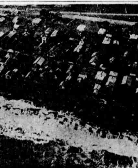
TIDAL WAVES HIT JAPAN —Huge tidal waves, coinciding with the peak of the monthly lunar cycle, rip along Japan's Pacific coastline 125 miles north of Tokyo. The waves, over 30 feet high, tore a gap of more than 1100 feet of sea wall and caused a 3000-foot section to sink in this area showing the big waves pounding shore where 60 houses were destroyed leaving 460 people completely homeless.