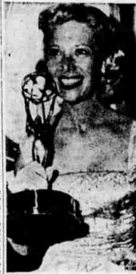
DINAH WINS AN EMMY —Dinah Shore clutches the Emmy she won from the television academy as the "best female personality of the year."