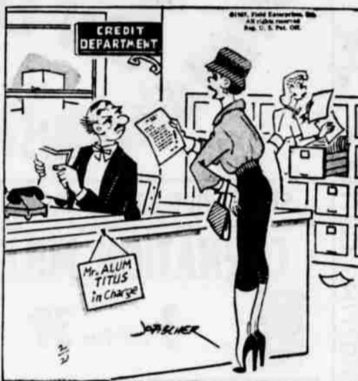
I don't like the tone of your letters! Is this the way to write to a customer who's owed you money for years?