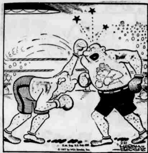
"Whatever you do, don't hit the wife or it'll be too bad for you!"