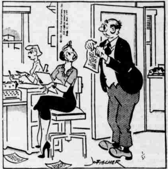
I'm not sure if I typed that or not. It all depends on whether you like it.