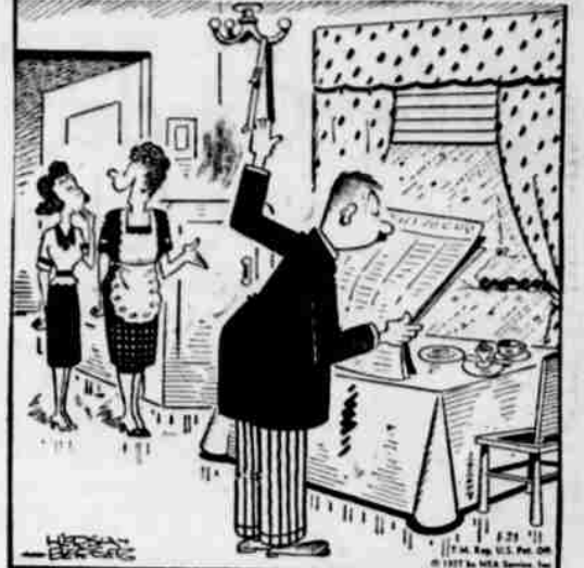
"We're snowed in, but your father gets the feel of going to work anyway!"