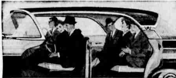
FAR BIGGER IN EVERY IMPORTANT DIMENSION —This year Mercury has grown bigger in every important dimension. Far more move-around comfort. For example, there's more headroom, more leg room, more shoulder room, more hip room.