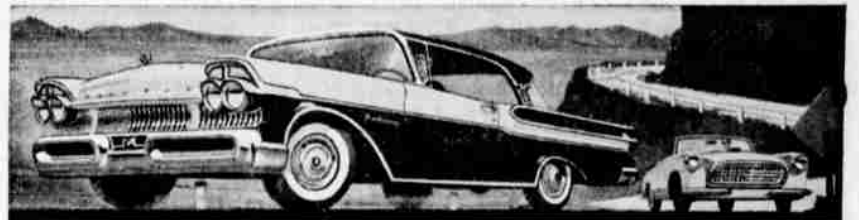
WIDEST RANGE AND CHOICE OF POWER IN MERCURY HISTORY —A 290-hp TURBOCHARGER V-8 engine is optional on all models. In the Montclair series the standard engine is a 255-hp Safety-Surge V-8 with a Power-Booster Fan that saves horsepower other cars waste. A 255-hp Safety-Surge V-8 is standard in the Monterey series. A special M-335 engine (335-hp) is available at extra cost in Monterey models equipped with standard transmissions.