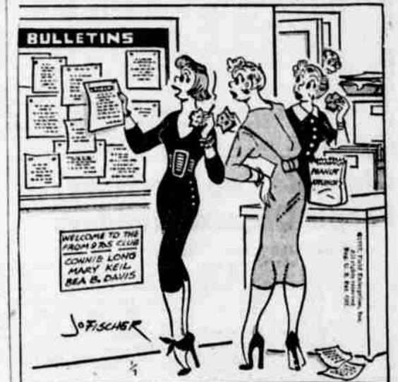
Look, kids. The boss has declared this Anti-Noise week. We're all supposed to eat marshmallows instead of the usual peanut brittle.