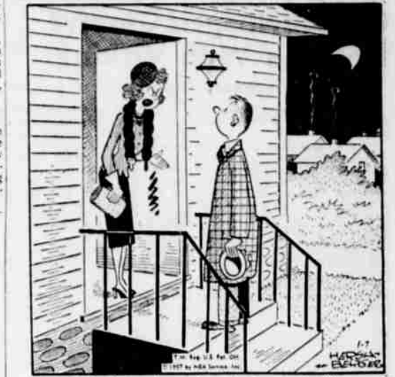
"Thank you for a nice reducing evening!"