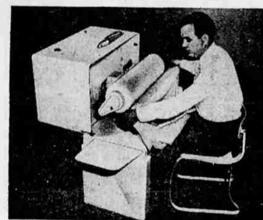
HUSBAND-PROOF—It's Christmas Eve and all through the house not a creature is stirring but this husband, trying out the new ironer he bought for his wife. He just wanted to make sure his gift would be the best. (P.S. When he finished ironing this shirt, he was convinced.)