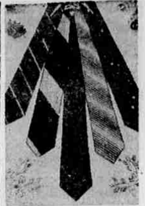
TO WIN WITH A TIE at Christmas, take a look at the smart new versions of the ever-popular diagonal stripes: wide and narrow, many combined with dot and scroll patterns.