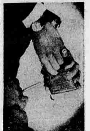
LIGHT UP the Christmas of a smoker with a matched set of sleek cigarette case and lighter patterned in horizontal stripes, with provision for initialing.

rolled into storage spots when not in use, and table models also are available. Table models take little storage space, but must be carried and lifted to the table where they are to be used.