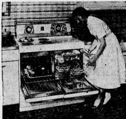
ALL-AUTOMATIC—With a new electric range, you don't have to keep opening the oven door to check temperatures. An automatic electric meat thermometer records temperature of meat, turns off the oven and turns on signal light when the roast is ready. With this range, homemaker may bake and broil at same time.

622 S.E. Trowbridge Phone Jackson ELECTRIC CO. OR 3-5521