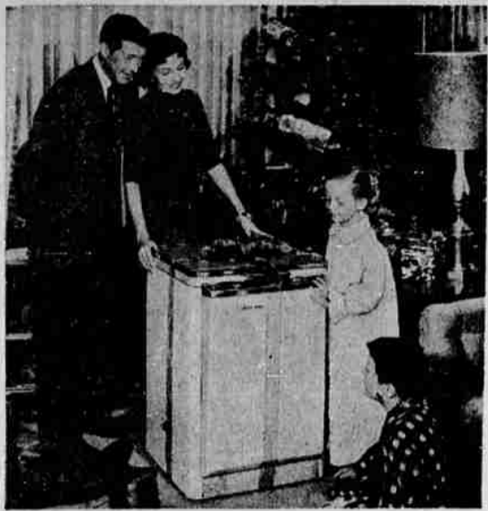
GOOD FOR MOM AND THE WHOLE FAMILY are the time and effort saving attributes of modern appliances such as this mobile electric dish washer, which eliminates after meal drudgery. That is why appliances make such good Christmas gifts.

Next to the housewife, the hardest-working occupant of any home is the water heater. Day and night it labors away, producing hot water for hundreds of personal and household uses. If you have one of the new electric water heaters, you're in luck. It has complete thermal insulation—top, bottom and sides. This reduces operation costs and avoids heating up the area in which it is installed. And you can install your water heater anywhere because there is no flue or vent connection needed. A counter-high model can be placed right next to the dishwasher, sink or clothes washer where much hot water is used. This is a practical spot for the heater, incidentally, because the water will stay hotter if it doesn't have to travel so far through the pipes to get where it's going.