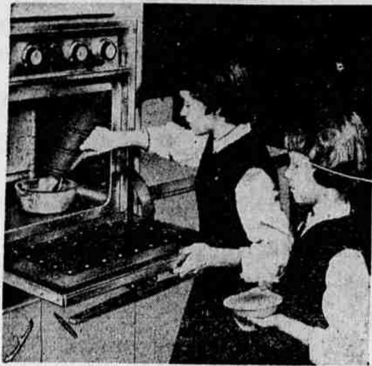
CAN I STIR, MOM?—Children are as fascinated by the revolutionary electronic oven as their mothers. Incredibly speedy—a cake bakes in six minutes—the oven heats only the food itself. The door and sides, even the utensils, stay cool.