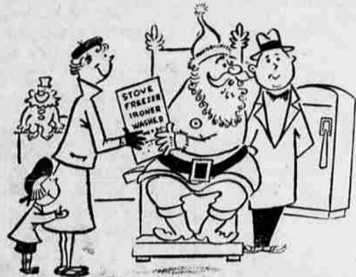
"You'd Better Get Acquainted With the Finance Manager."

rolled into storage spots when not in use, and table models also are available. Table models take little storage space, but must be carried and lifted to the table where they are to be used.