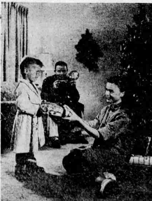
A NEW DIMENSION IS ADDED TO THE MEMORIES of Christmas when the peak moment is captured and held in life like manner on color stereo slides which may be made as easily as any snapshot. That's what Daddy is preparing to do above, as Mother hands Junior a surprise package.

GIVE HER THE "SAVINGEST PAIR FROM FRIGIDAIRE"