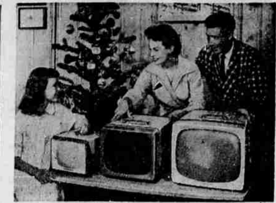
ASCENDING POPULARITY OF PORTABLE TV sets offers the opportunity as shown here, for an individualized gift to everyone in the family this year. Left to right, with nine inches and 17 inches screens. Available in colors.

In 1955, 70 to 75 per cent of one billion dollars worth of refrigeration sales was in replacement of old units—indicating there is a substantial number of homes in need of new refrigerators.