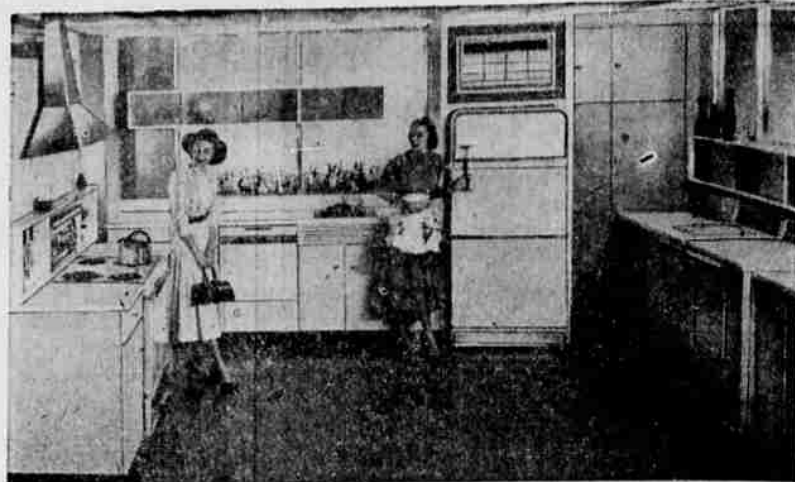
DREAM KITCHEN — This is a practical reality in the average American home. Electric appliances, finished here in fashionable pink, include a 30-inch electric range with French doors, mixing center, dishwasher and built-in refrigerator. Automatic washer and dryer are along the right wall. Kitchen decor in this case is off-white and gray.

Experts will advise you to get professional planning help if you can, but see to it that your kitchen and laundry fit your family.