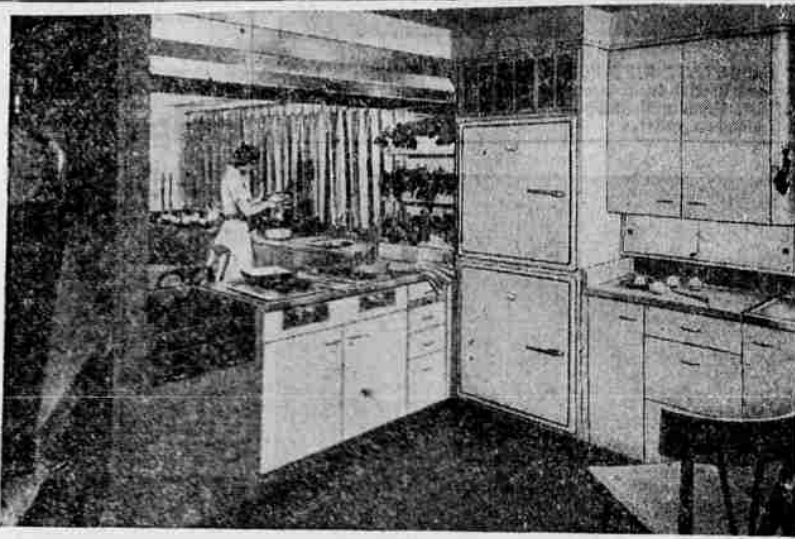
PRACTICAL BEAUTY — The latest appliance styles — built-ins, counter-top units, and steel cabinets — make this kitchen an eye-catching blend of the modern and traditional.