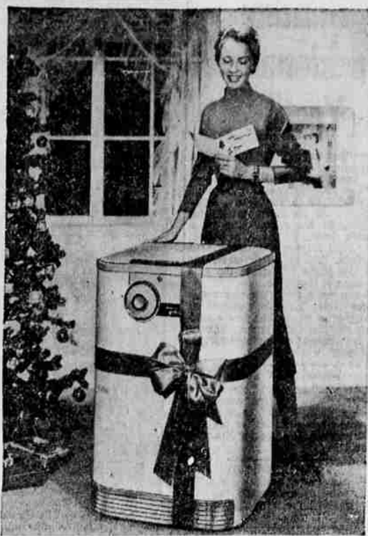
MOST WELCOME — A gaily ribboned mobile dishwasher under your Christmas tree means a year-round holiday from laborious dishwashing chores. Since it's portable, it saves installation bill and can be rolled around the room like a serving cart to pick up dirty dishes.

GIVE GLAMOUR Especially glamorous gifts this Christmas are housecoats and robes in such newly opulent fabrics as rich brocades, satins and other "evening" materials.