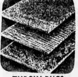
THROW RUGS Every home has need for several throw rugs to take the abuse of heavy traffic and protect floors. Choice of colors, materials and sizes. Gift priced from . . .