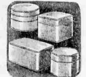
HASSOCKS Use as extra TV seats or for foot rest in front of the favorite easy chair. All sizes from the small to the giant. Wide color selection. Priced from . . .