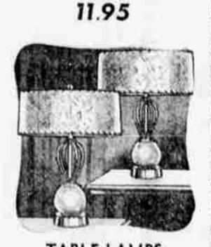
TABLE LAMPS Attractive lamps give extra light, color to rooms. Choose from ultra smart to traditional styles in our collection. Gift priced from . . .