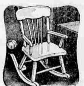
MUSICAL ROCKER A rocking chair for the young one. Sturdily constructed for active use. Every rock brings forth music. Don't overlook the child on your list this year. Give this chair. Priced at . . .