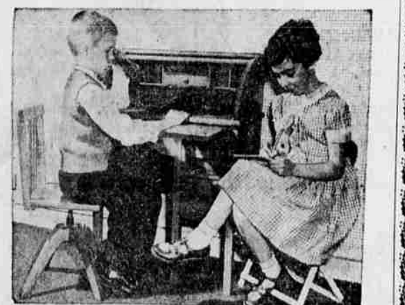
THE BIG DEAL HERE STARTS WITH CHRISTMAS in terms of scaled down office furniture that help Junior play executive and sister exact the role of secretary. Make the phone a part of the gift.