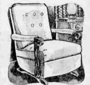
PLATFORM ROCKER Give them luxurious lounging and rocking comfort during the year. Choose their favorite chair from our stocks now. Priced from . . .