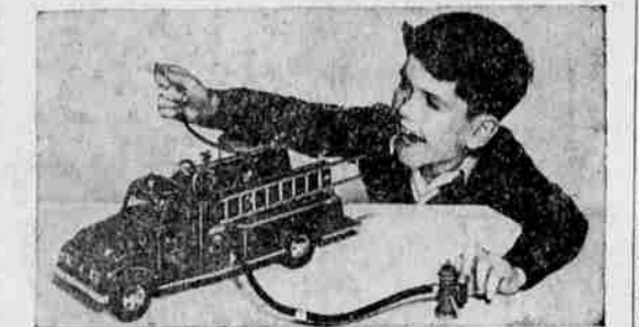
YOUNG FIREMEN go goggle eyed at this suburban pumped with its own water hydrant that connects to garden hose for real life, steam throwing operation.

This year many scale modelers are turning their attention for the first time to atom-propelled craft like the submarine Nautilus. Here's a Breather The toy industry may well have reached a kind of absolute limit in its search for adult ideas with which to use his own lungs to still another device. Taking their tip, apparently, from modern man's all-out pursuit of labor-saving devices, the industry has come up with a child-labor-saving device. No longer is the child required to use his own lungs to blow bubbles. Now, with a newly designed bubble-twirler, he can make almost endless streams of bubbles with just one sweep of his little hand.