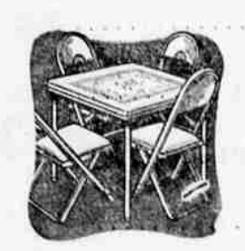
BRIDGE SET The family will find dozens of uses for this set all through the year. Choose from our stocks of famous tables and chairs. Priced from . . .