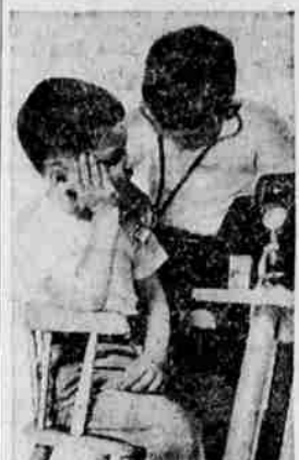
PLAYING DOCTOR is made possible by realistic kit used here in office furnished with young ones' tables and chairs.