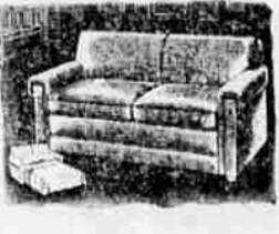
SEALY SLEEPER By day an attractive sofa . . . by night the most comfortable bed yet. Covered in rich fabric. 219.50