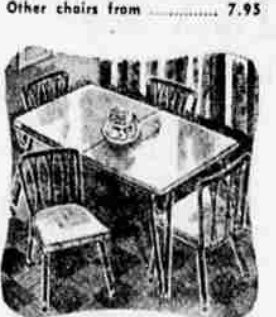
5-Pc. DINETTE Choose either ultra modern, gleaming chrome made by Virtue. A gift for the dinette at just . . .

FREE DELIVERY 435 SOUTH EAST JACKSON DOWNTOWN ROSEBURG