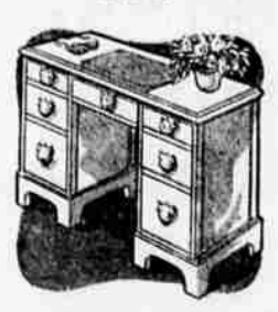
HANDSOME DESK Every home needs a desk . . . the one gift every member of the family will use. Choose from our selection of woods and finishes. Priced from . . .