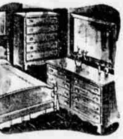
BEDROOM SUITE Sleeping comfort and smart looks are sure to please every night of the year. Choose from modern or traditional in a host of woods. Gift priced from . . .