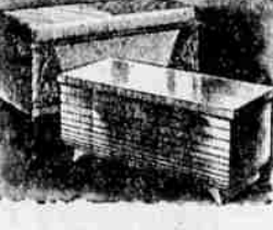
CEDAR CHEST This is a gift that will be cherished for years by the ladies of the house. Give protection to clothes. Smart stylings by LANE Cedar Chest. from 54.95