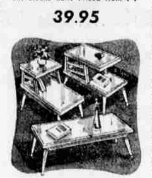
MODERN TABLES For beauty, use and decor, give one, two or more of these modern tables from our stock. Gift priced from . . .