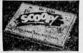
NEW AS TODAY'S NEWS is the game called "Scoop" which makes "reporters" of players who compete to complete a "front page."