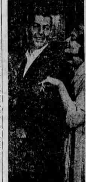
ROBED THE RIGHT WAY on Christmas morn is the man-of-the-house in this luxurious dressing gown in dark bronze with large black dots.

FINE FOR ALL "To all of you from all of us" are game gifts such as sets of cards, books of crossword puzzles, word games or chess sets. "Big" gift idea along the same lines is a game table or a complete group of card table and chairs for the recreation room.