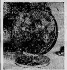
GIVE THE WORLD, in the form of a globe this Christmas. Adults and children alike are candidates for this gift available in sizes and styles to fit any budget.