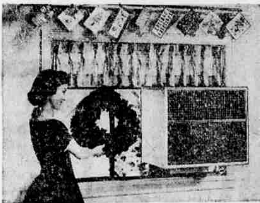
WORTH THINKING ABOUT FOR CHRISTMAS is a gift of air conditioning, which can serve in colder weather as well as in the summer time, especially to clear the air in the home no matter how large your Christmas party.

Stocking stuffer for the picture maker can be a "sleeve" of flash-light bulbs.