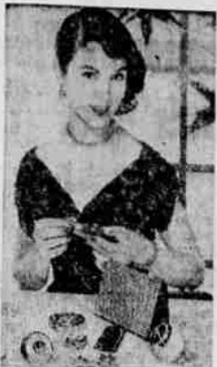
The shining hour—Christmas Eve. And this pretty miss fills her glittering evening bag with sparkling accessories—a slim compact, a small square pill box and case.

Heralding a Yule season of happy hunting for "her" and happy hunting for "him," Santa and fashion join in presenting a wonderful variety of gifts calculated to deck every woman with Christmas glamour. From hats to hose, from coats to lingerie, from bath preparations to exotic perfumes, there are just right presents for the personal pleasure of every girl and every woman, be she teen-ager, career girl, homemaker, mother or grandmother.