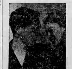
There's no time like Christmas to give or receive a smart, dependable watch. For him—the "Barry"—a slim square-faced timepiece with an easy-to-read dial. For her—the dainty "Belle"—with a handsome leather bracelet.

While neckties are among the first things that come to mind when setting out to gift a man at Christmas, this year you can give this perennial favorite a new and somewhat sumptuous slant