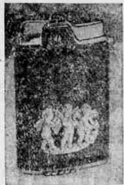
So very feminine—so elegant in design is purse lighter with gentle blue enameled body graced with white cherubs. Another exclusive feature of the dainty lighter is its swivel base.

Several of these items can be grouped to make a lavish gift at little cost, or they can even be used as packaging materials. A kitchen wastebasket, dish drainer, mixing bowl or plastic tray (for fruit) can be heaped with flat, candy or gadgets such as cheese cutters, measuring spoons, vegetable scoops, stove-top salt and pepper, cake servers, pepper mills and a host of others. Thrifty little gifts that gratify are spice shelves, plastic planters for growing parsley or herbs, pegboards to hold kitchen utensils, cookie jars, lazy susans and matched sets of mixing bowls. Ornamental as well as useful are enameled or copper-bottomed pots and pans. Also in the group of major kitchen gifts are sets of pottery or plastic dishes.