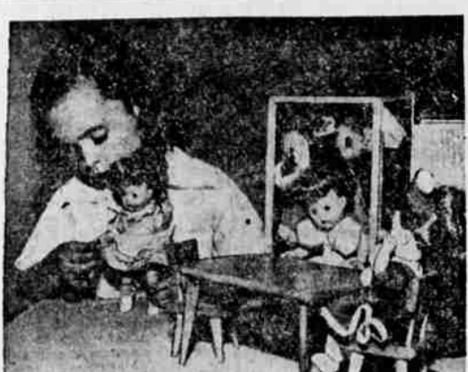
NEW TREND IN LAND OF DOLLS Brings the "eight inchers" with perfectly scaled furniture and fashion wardrobes, making way for development of families.

Television Influences Gift Of Hanky For Men The popular TV-fold manner of a touch of smart individuality. This is an excellent gift idea, but you should order early, if monogramming is involved.