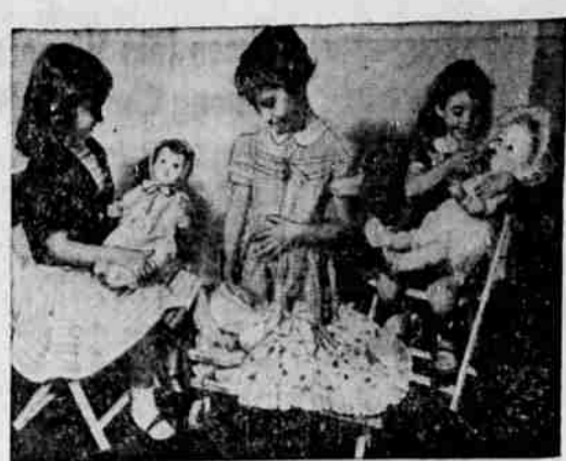
PLEASING LITTLE MOTHERS WITH BABY DOLLS for this Christmas will not be difficult at all since the selection is so wide and everyone so adorable. Witness the reactions here as tested on three little girls.