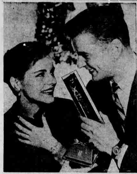
THE PLEASURE IS MUTUAL when watch gifts are exchanged on Christmas morning by a loving twosome. Shown here, her watch is a truly feminine timepiece, encrusted with diamonds; his is a handsome masculine model with five diamond markers.

She may want one pair that are low-cut of light-weight glove leather for hot weather and a pair that are cut higher and are