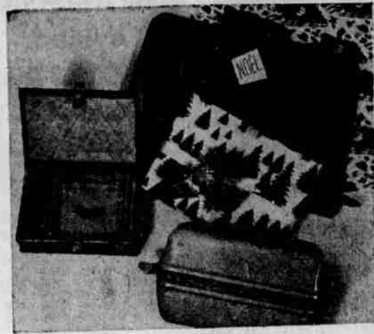
GOOD TRAVELING COMPANIONS in polished leather for the man-on-the-go: Left, a suede-lined stud box with separate compartments; front, a useful, waterproof toiletry kit; back, an executive-styled zipper case for important papers.

Shining assets to entertaining are silver cigarette urns, individual ash trays and silver butter plates. Magnificent both to use and to display is a silver coffee or tea service. Hope chests are far from old-fashioned. Many young girls in their teens are collecting essentials for future housekeeping, among them silver flatware and holloware. A chest of plated flatware would indeed be a cherished contribution. Picture frames, dresser sets and dainty clocks are gifts of silver she can enjoy right away. A child's first life-time possession is very often a silver baby cup. There are other gifts of silver for babies and young children: gifts that, with the years, become heirlooms for future generations to use and enjoy: baby spoons and forks, long-handled feeding spoons, small picture frames, porringers, bib holders and junior-sized place settings, among them. For the man in the house, your jeweler has a wide variety of silver gifts for his home and office: cigarette boxes, table lighters, ash trays, etc.