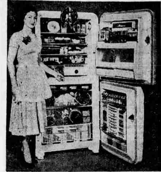
THEY SAY MERRY CHRISTMAS THE YEAR 'ROUND , do these modern home appliances exemplified here by the convenient combination of a family size refrigerator in the upper half and a roomy food freezer in the lower half.