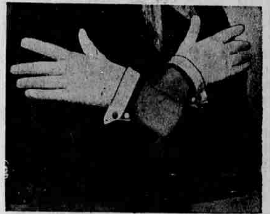
TO GET GIFT PROBLEMS WELL IN HAND , Santa suggests glamorous gloves. Hand-or-machine washability of leather gloves adds to the joy of the gift.

A bouffant petticoat to wear under her favorite full-skirted fashions is sure to delight any teen-ager on your list, while the more mature woman will be flattered by your choice of a slim Empire slip, lavished with lace and embroidery. These look elegant and fragile, but may be had in nylon and other miracle fabrics that are a breeze to care for—an added factor all women will appreciate!