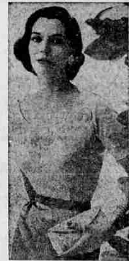
Sweatered elegance for after-five is typified by this beautifully decorated evening sweater of "Orlon". Underlining this satin-edged scoop-necked pullover sweater are graceful sprays of bugle beads and pearls.

There's something luxurious and unmistakably masculine about good leather that appeals strongly to most men. This makes well chosen gifts of leather especially appropriate for a man's Christmas. Starting with a man's pocket, there is a wide array of smooth and richly textured leather wallets, pocket secretaries and key containers, many of which are available in matched sets; also tobacco pouches and leather-encased lighters. If he does any traveling, leather luggage offers a wealth of gift suggestions, ranging from an overnight bag to a capacious two-suitcase for longer jaunts. For his toiletries, there are compact leather kits, waterproof-lined, that zip and close. For his desktop at home or office, there are individual items and matched sets in leather. To carry his business papers there are sleek leather briefcases, either envelope type or with handles, as well as the popular new attache cases.