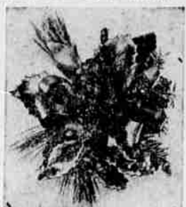
HOLIDAY CORSAGE features needed pine holly and miniature cones with red berries and ribbon.