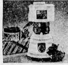
ELECTRIC DUTCH OVEN shown above is new this year. Just the gift to be accompanied by a Christmas plum pudding ready for steaming.