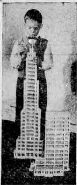
SKYSCRAPER BUILDERS can erect structures as "high" as the famous Empire State building with plastic blocks that teach principles of architecture and design.

If you keep your Christmas gift poinsettia well watered while it is blooming, then let the blooms and leaves fade, you can save the plant to bloom again for next Christmas. It should be put away in a cool dark place to rest until next Fall.