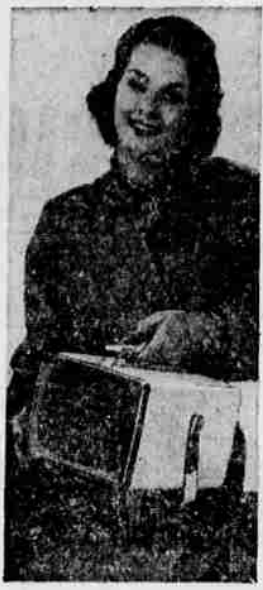
PERSONALIZED TELEVISION portables for Christmas giving are now available in sizes only slightly larger than a table model radio. They come in many colors.