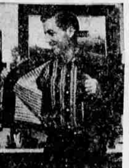
SMILING APPROVAL greets gift of knockabout jacket; dark brown shell of nylon, lined with a soft fleece nylon fabric in brown and natural stripes.