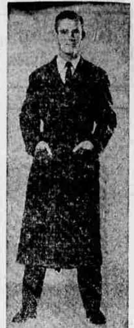
Lively plaid tailored robes for the men of the family, in warm and washable Vicara. Soft as a morning breeze and comfortable as an old shoe, but so handsomely masculine!

Fashion accessories are an especially gifted solution to the problem of what to give her for Christmas this year. No woman ever has too many of them, and they are now more glamorous, more elegant — and more welcome — than ever before! All love costume jewelry, and the new designs fully capture the glow of Christmas with gleaming gold-colored metal and richly colored stones. Also sure to brighten her life — and her wardrobe — are such gifts as gay scarves, little wool and leather tie-on collars and handkerchiefs. College and career girls love them for their wardrobe-stretching versatility, and all fashion-conscious women appreciate an "extra" touch of elegance for their costumes. For someone "special" an extra-special gift choice sure to be a hit this year is a fur muff. They are enjoying a big revival and offer luxury without too great a strain on your budget. If she's a romantic, she'll love a gift of one of the new "hat-tier" hats. They're lushly elegant with rich materials and trims of jewelry and feathers. New gloves are on hand for gifts which happily combine the pretty and the practical in leathers that are fully washable. You can cater to her love of the un-