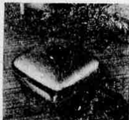
AUTOMATIC FRY PAN , handsome as a fine piece of silver, boasts dial for regulation of correct cooking temperature.

Automation in major home appliances has its counterpart in the field of electrical housewares coming onto the market just in time for Christmas giving this year. The great variety of small, convenient and decoratively designed cookery devices, for example, will be found encompassing units that boast heat controls, timers, and signal lights. But cookery devices, such as electrical "dutch ovens," versatile waffle makers, fry-pans and broilers, are but part of the picture. Remember, there also are travel irons and steam irons, which make wonderful gifts. There is the electric blanket and the electric sheets. There are the pop-up toasters, now available in colors to match almost any decor. And there are coffee makers that look as handsome as fine silver. Altogether there are more than thirty of these special, beautiful and useful servants from which to choose gifts especially for the hostess, which term, of course, includes mother. The danger of giving electrical housewares gifts to someone who already has what you have chosen is minimized because, chances are, your gift will replace some old and long used device by one that's new, modern and up to the minute.