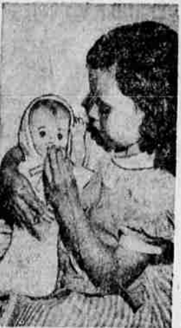
BASIC TRAINING for future baby sitters is assured by baby dolls such as the above, accompanied by kits for their care.