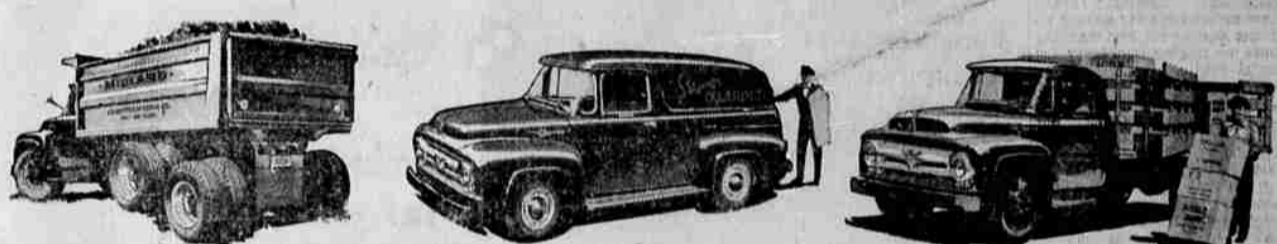
Ford tandem axle BIG JOBS are rated to carry more payload than comparable tandems of any of the leading manufacturers. T-800 model has max. GVW of 45,000 lb.—GCW is 65,000 lb.