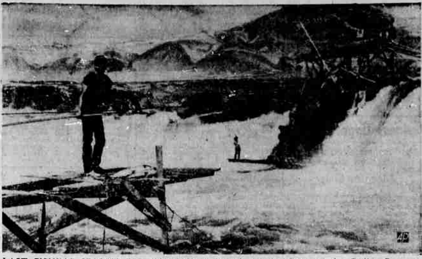
LAST FISHING SEASON FOR INDIANS —Progress, in the form of the Dalles Dam on the Columbia River, will eliminate the famous Indian fishing grounds at Celilo Falls. By next salmon run in the spring, Celilo rocks will be below surface of reservoir behind the dam. The Indians have fished here for a generation under treaty rights, first with spears and now with nets. Three tribes accepted payment from the federal government for loss of the fishing rights. Two Indian netters on flimsy platforms are shown at work. Man at left has two salmon on platform.