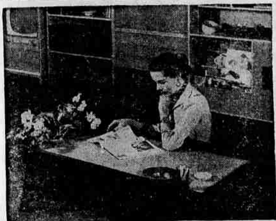
COFFEE TABLE —A versatile and functional accessory to any home is this easy-to-build table constructed of fir plywood.

YOU KNOW SHE'LL JUST LOVE AN UP-TO-DATE KITCHEN