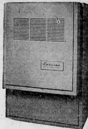
Five feet high, three feet square, this Weathermaker will air condition every room in the average five or six room house.

Carrier Weathermaker air conditioners will heat and cool both new and old homes